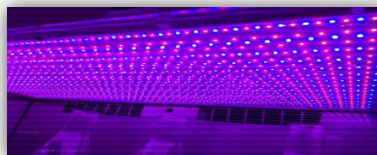
P5011RB: (50% Red, 50% Blue)