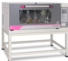
ZWYR-D2401 With P5010

This ZWYR-D Series shaking incubators can be stacked up to three units high, providing laboratory professionals tripled culture capacity, while still only occupying the same "footprint" of a single shaker. All models feature an insulated, fold-down door with double-layer glass window for high visibility. On all refrigerating models, microprocessor controller provides unmatched versatility by enable users to create personalized program (with up to 9 segments, with cycling) to automate changes to function parameters.