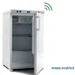
FOC 120 E Connect From 3 to 50 °C