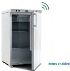
FOC 120 I Connect From 3 to 50 °C