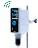
ermes enabled OHS 200 Advance Up to 100 L Up to 100.000 mPa*s