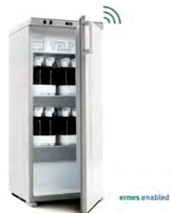
FOC 200 E Connect From 3 to 50 °C