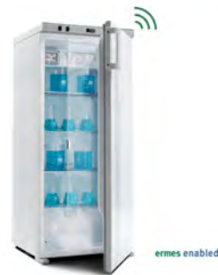
FOC 200 I Connect From 3 to 50 °C