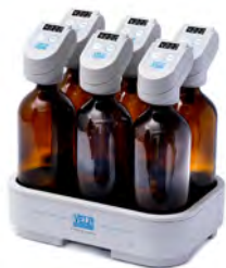
BOD Sensor System 6 - 10 positions - Results on display