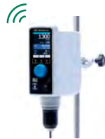
ermes enabled OHS 100 Advance Up to 100 L Up to 70 mPa*s