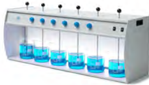
FC4S AND FC6S