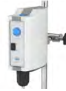
PW Up to 70 L Up to 100.000 mPa*s