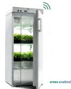
FOC 200 IL Connect From 3 to 50 °C