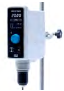
OHS 200 Digital Up to 100 L Up to 100.000 mPa*s